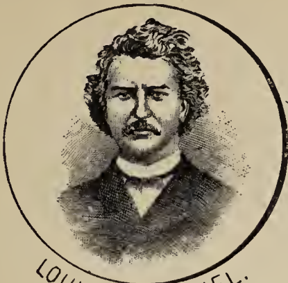
LOUIS DAVID RIEL.